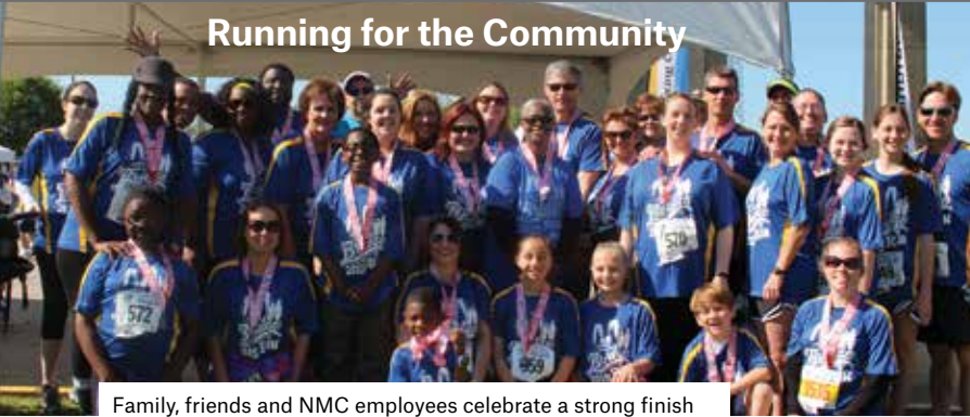
Family, friends and NMC employees celebrate a strong finish in the annual United Way of St. Charles Bridge Run across the Hale Boggs Bridge.

NMC employees and their families stepped up and stepped high to run across the Hale Boggs Bridge in the United Way of St. Charles 19th annual 5K/10K Bridge Run/Walk March 28th. The NMC runners, walkers and a few in strollers were among 2,400 individuals participating in the race to raise funds for the United Way and awareness of community outreach programs.